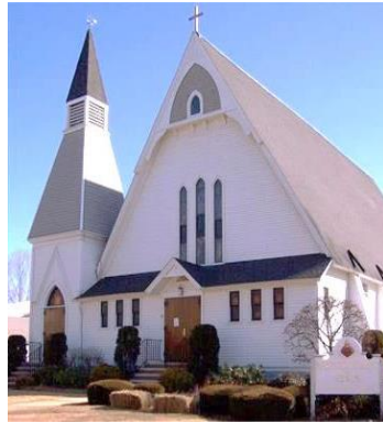
Sacred Heart of Jesus Church 22 West Main St. West Brookfield, MA 01585

Mass Cards Mass Cards for the living or deceased and for special occasions are available at the rectory. If you call ahead (leave a message if necessary) we will have it ready for you.