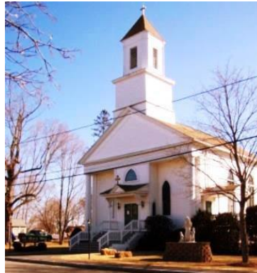
St. Mary Oratory 11 Lincoln St. Brookfield, MA 01506